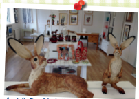
Art & Craft Gallery