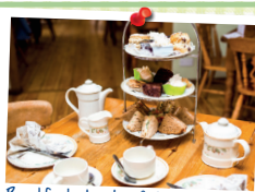
Breakfasts, Lunches & Cream Teas