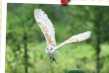
Falconry Displays & Experiences