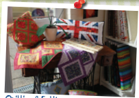
Quilting & Felting