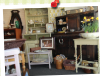
Vintage Collectables and Furniture