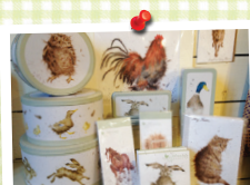
Large Selection of Gifts & Cards