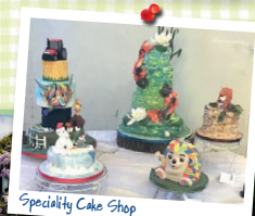
Speciality Cake Shop