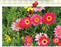
Beautiful Flowers & Plants